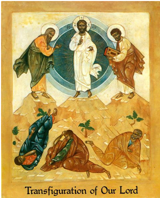
Transfiguration of Our Lord