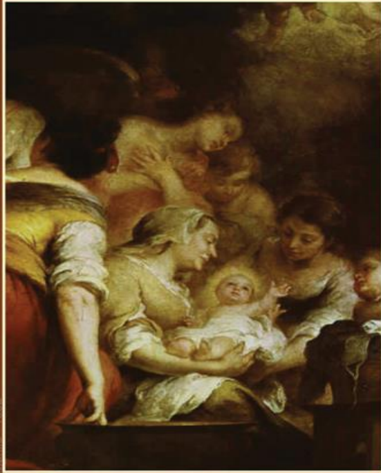
The Birth of the Blessed Virgin Mary Feast Day - 8 September